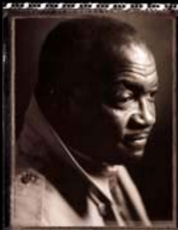
Stan Portrait Download hi-res jpg