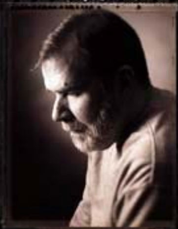
Hal Portrait Download hi-res jpg