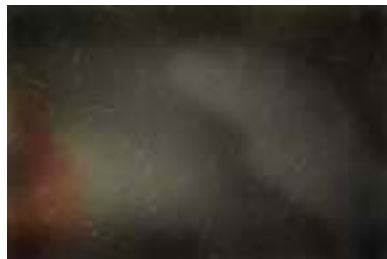
Hal Illustration Download hi-res jpg