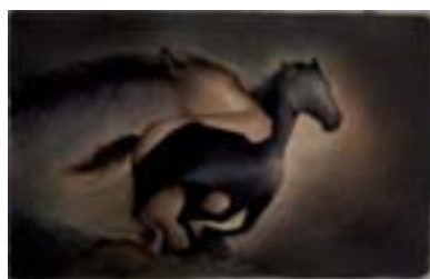
George Illustration Download hi-res jpg