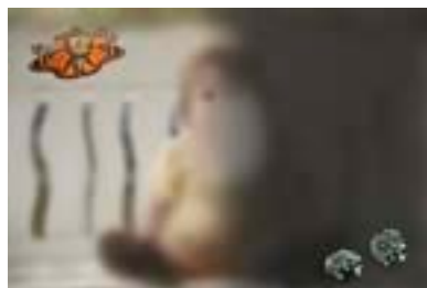
Helen Illustration Download hi-res jpg