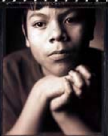
George Portrait Download hi-res jpg